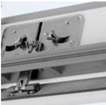
1 Lock casing