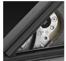
8 Hinges with friction