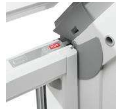
4 Data plate lower, fixed section