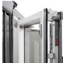
3 Data plate lower, opening section