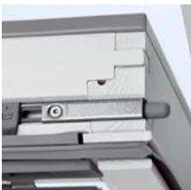
9 Barrel bolts