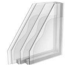
7 Triple glazing