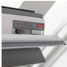
2 Data plate upper section