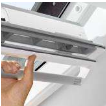
5 Control bar