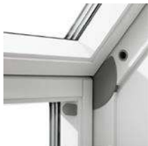
10 Barrel bolt bushings